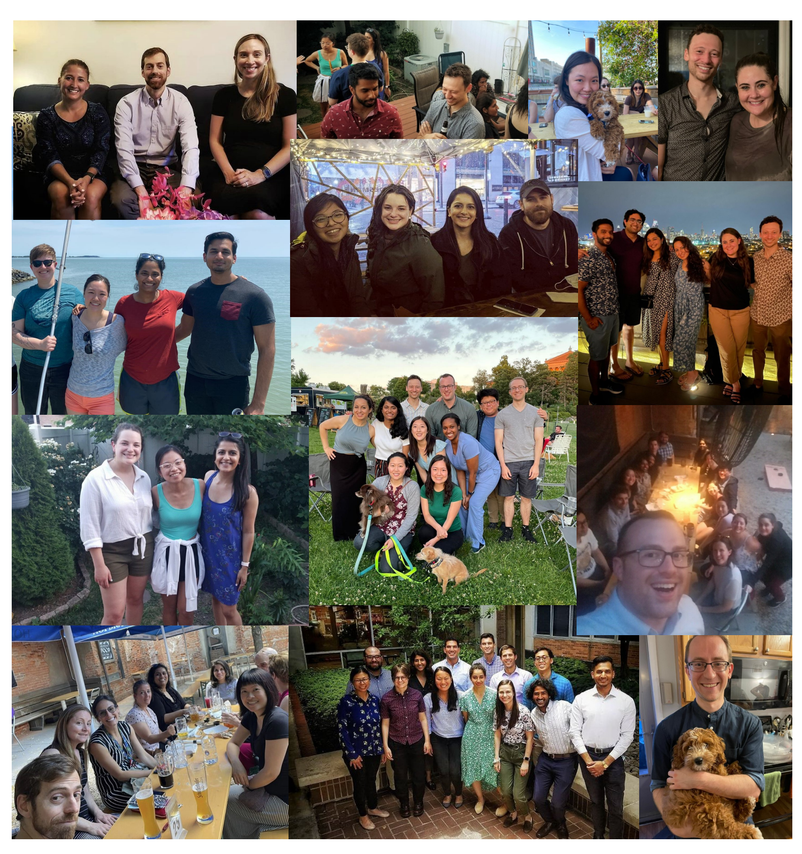
Temple Psychiatry 17 Summer 2021