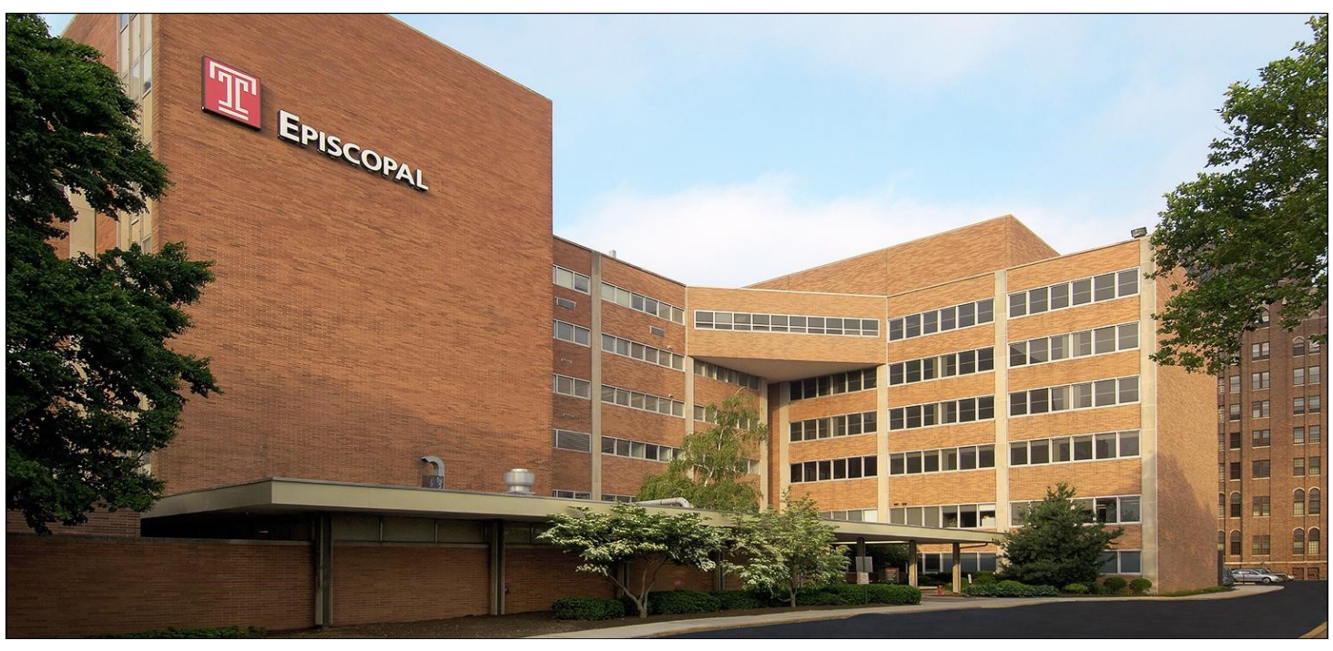
Temple Psychiatry 2 Summer 2021