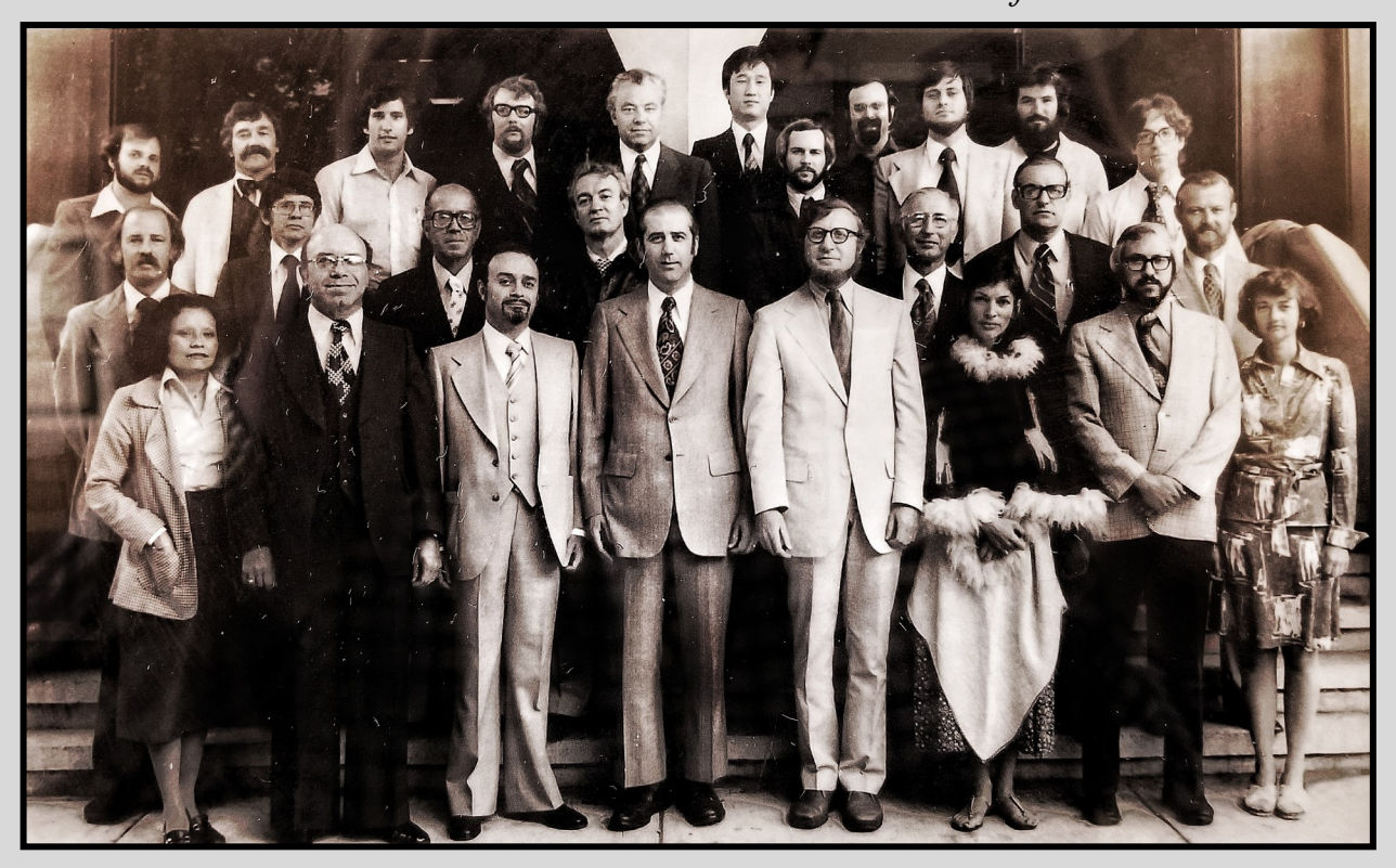
Temple Psychiatry 20 Summer 2021