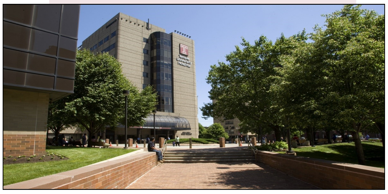
Temple Psychiatry 5 Summer 2021

Coordinator of Psychiatric Services Tuttleman Counseling Services Temple University